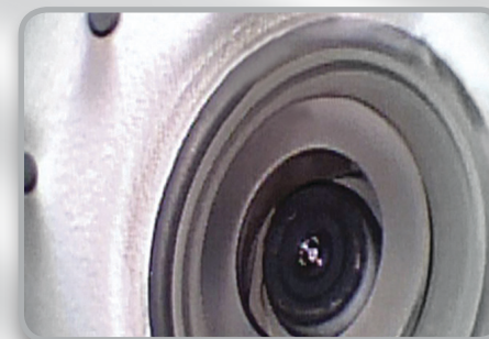
Aircraft Combustion Chamber