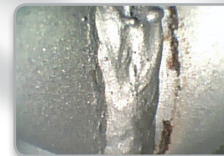
Orbital Weld (Using a 90° Prism Tip)

Hawkeye® V2 Video Borescopes are fully portable, finely constructed, and deliver clear, bright high resolution photos and video! The 5" LCD monitor allows comfortable viewing, and intuitive, easy-to-use controls provide photo and video capture at the touch of a button! V2's have a wide, 4-way articulation range, and are small, and lightweight. V2's are available in both 4 and 6 mm diameters. Optional 90° Prism and Close-Focus adapter tips.